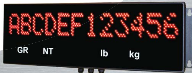
Aurora ALPHA 12