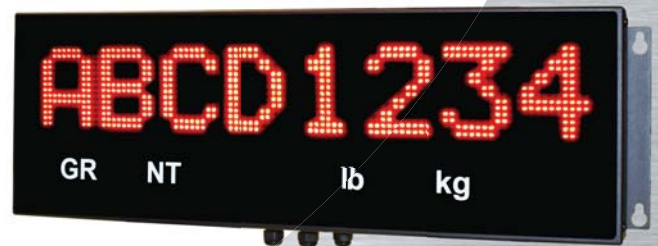
Aurora ALPHA 8

ALPHA 12: 12 characters, 3.5 inch (89mm) high.