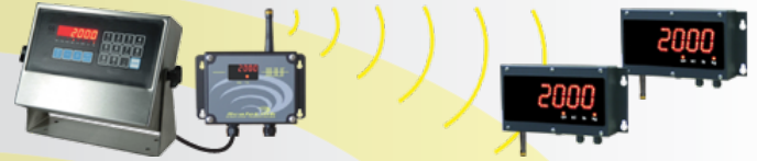
SCALE TO MULTIPLE REMOTE DISPLAYS