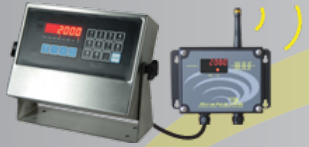
SCALE TO REMOTE DISPLAY