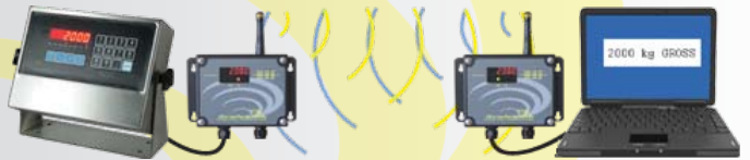
SCALE TO PC (1 OR 2 WAY COMMUNICATION)

* 2 ScaleLinks required for wireless communication between devices.